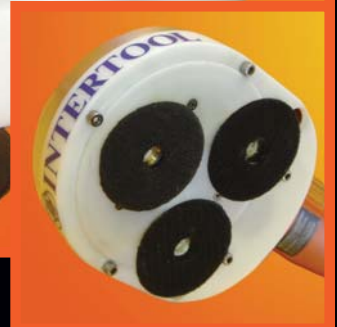
Planetary Polishing System

The DS 175 7" Planetary Polisher is a sturdy, planetary powered transmission that can be driven with any 5/8-11 (or optional 14-2 mm) right angle tool, operating less than 5,000 RPM. A variable speed power unit is optimum. Three, 3" inch, planets rotate around the center at the same speed as the driver. If the driver rotates at 4,000 RPM, the planets rotate at 4,000 RPM.